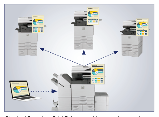
Standard Serverless Print Release enables users to securely print a job and release it from up to six supported models on the same network.