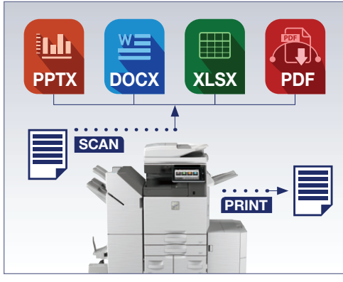
Scan and convert documents to popular file types seamlessly with Sharp's built-in OCR function.