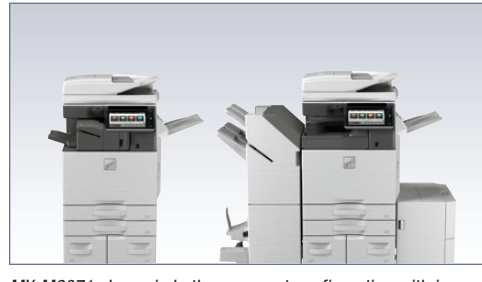
MX-M6071 shown in both a compact configuration with inner finisher and full configuration with saddle stitch finisher and large capacity cassette.