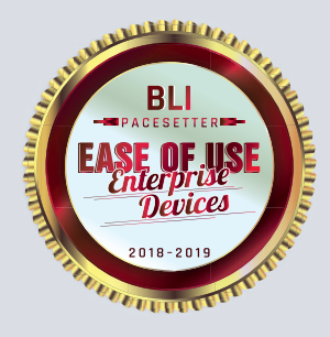
"PaceSetter Award in Ease of Use 2018–2019"