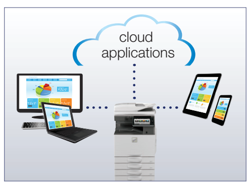
Access popular cloud applications, distribute files and print documents more easily.