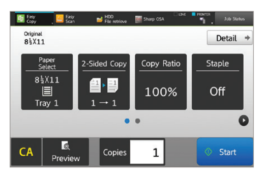
Easy Copy Screen offers the most commonly used settings.