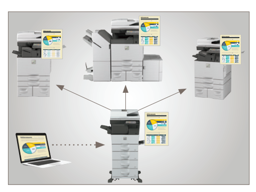
With Serverless Print Release you can securely print a job and release it from up to six Sharp MFPs (including host).