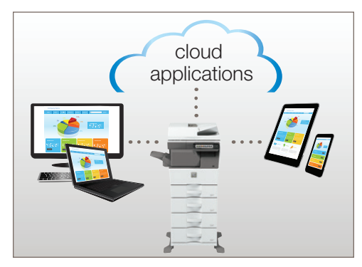
Distribute, access and print documents more easily.