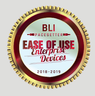
"PaceSetter Award in Ease of Use 2018–2019"