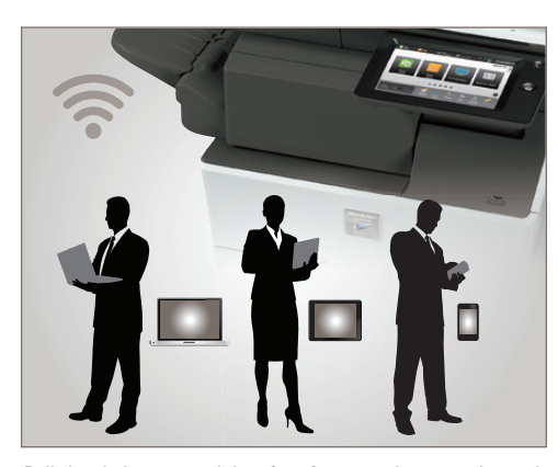
Built-in wireless network interface for convenient scanning and printing from mobile devices.