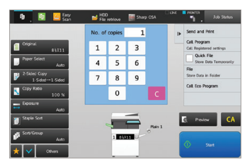
Standard Copy Screen offers more advanced features.