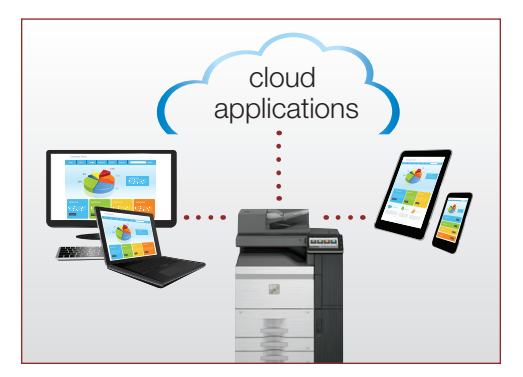
Access popular cloud applications, distribute files and print documents more easily.