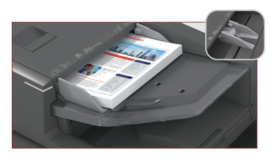
High capacity 300-sheet DSPF with 150-business card feeder for increased efficiency and scanning capabilities.