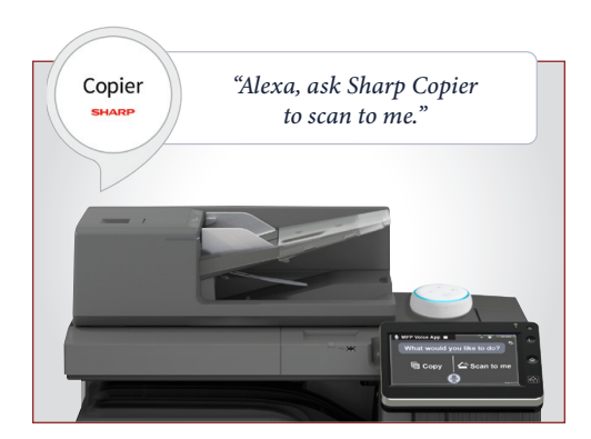
MX-8081 shown with available Sharp MFP Voice feature with Amazon Alexa.