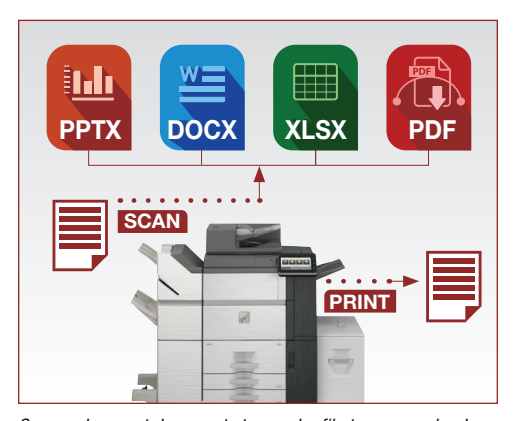
Scan and convert documents to popular file types seamlessly with the Sharp built-in OCR function.