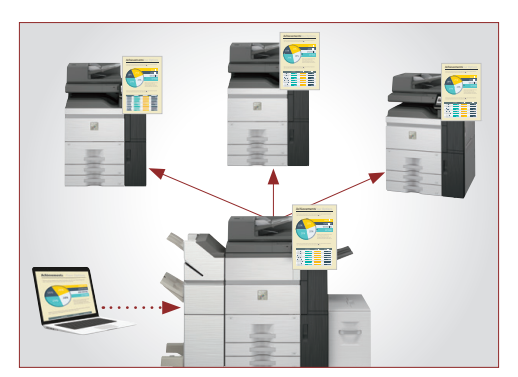
Standard Serverless Print Release enables users to securely print a job and release it from up to six supported models on the same network.