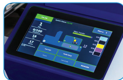
Intuitive 7" color touchscreen displays system status, image preview, and provides access to stored jobs