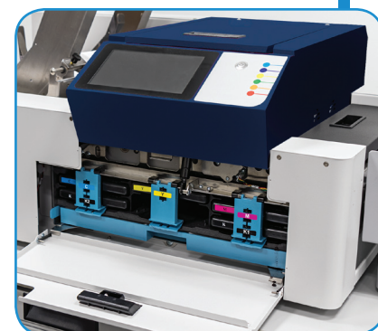
Clamsell design offers easy front access to ink tanks and paper path