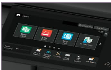
Easy touch display with customizable menus.