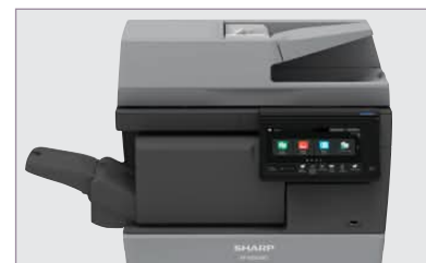
Optional compact inner finisher offers stapling, offset stacking and sorting.

Compact designs with advanced workflow features for virtually any size office.