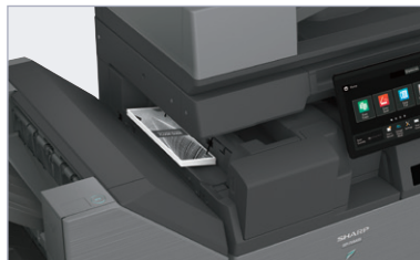
New Inner Folding Unit option offers a variety of fold patterns, including tri-fold, z-fold and others.