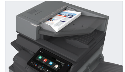
High capacity 300-sheet DSPF scans documents at up to 280 images per minute.