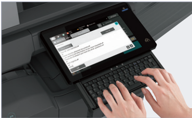
Built-in retractable keyboard simplifies email address and subject line entries.