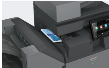
New Inner Folding Unit option offers a variety of fold patterns, including tri-fold, z-fold and others.