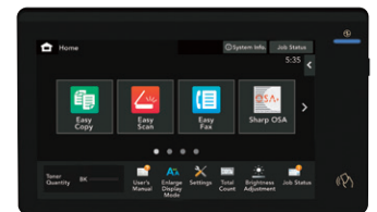
10.1" (diagonally measured) customizable touchscreen display.