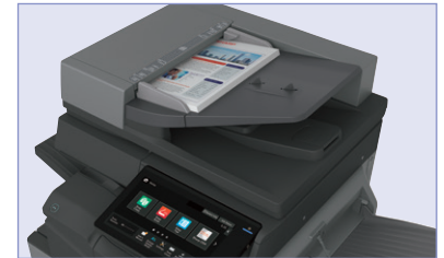
100-sheet RSPF scans documents at up to 80 images per minute.