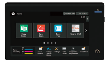
10.1" (diagonally measured) customizable touchscreen display.