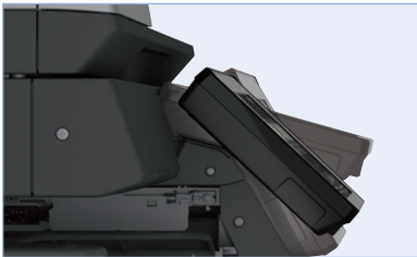
Pivoting Touchscreen offers the viewing angle for any use instantly.