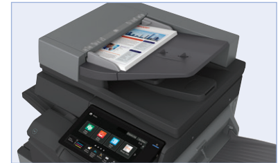
100-sheet RSPF scans documents at up to 80 images per minute.