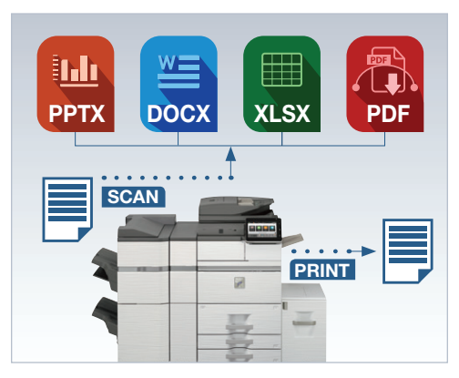
Scan and convert documents to popular file formats seamlessly with Sharp's built-in OCR function.