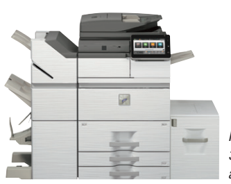
MX-M7570 shown with 3K saddle stitch finisher and large capacity cassette.