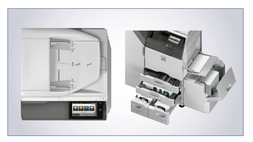
Easy-to-use, compact design.