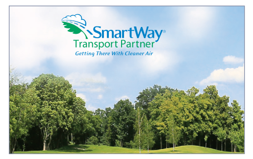
Sharp is committed to environmental leadership.