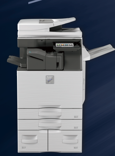
* Some features require optional equipment.