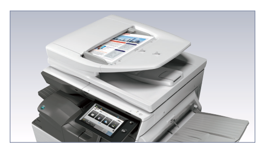
Standard 100-sheet reversing document feeder.