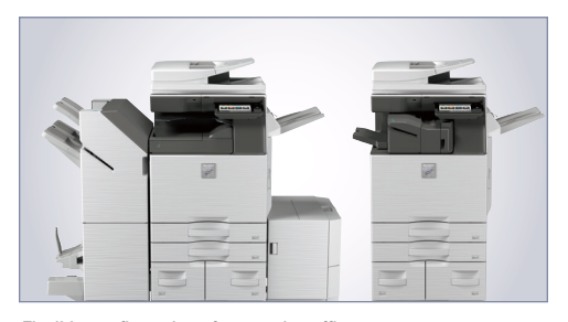
Flexible configurations for any size office.