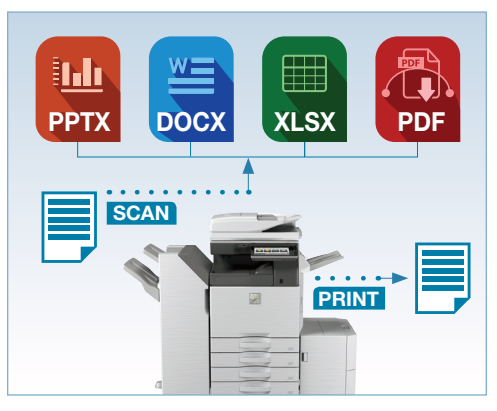
Scan and convert documents to popular file formats seamlessly with Sharp's built-in OCR function.