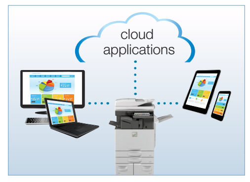
Distribute, access and print documents more easily.