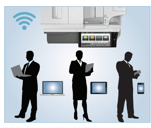
Built-in wireless network interface for convenient scanning and printing from mobile devices.

Standard Copy Screen offers more advanced features.