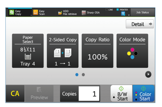
Easy Copy Screen offers the most commonly used settings.