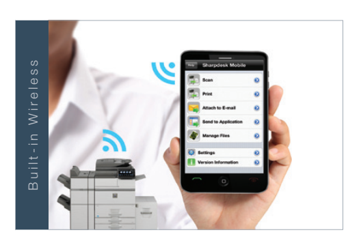
Built-in wireless network interface offers a point-to-point mode for convenient scanning and printing from mobile devices.