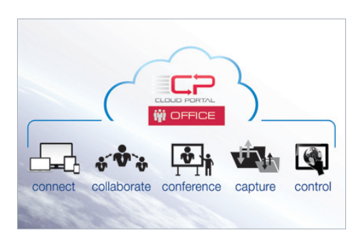
Work more efficiently and collaborate more easily with Cloud Portal Office.

A flexible design from paper handling to networking – the MX-M654N and MX-M754N monochrome workgroup document systems will exceed your expectations.