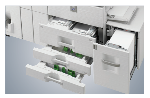
Available paper capacity stores up to 6,700 sheets.