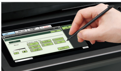
High-resolution touch-screen with stylus pen for easy point-and-touch operation.