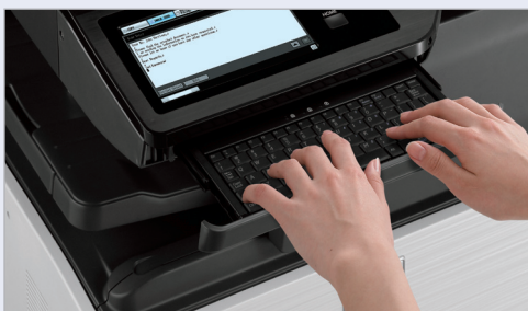
Easy-to-use optional, full-size, retractable QWERTY keyboard.