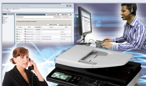
Sharp Remote Device Management.

The MXM264N/M314N/M354N implement versatile device management capabilities through user-friendly software to achieve ultimate efficiency.