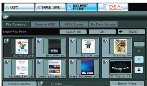
Sharp's easy-to-use document filing system with thumbnail preview.*