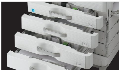
Available paper capacity stores up to 2,100 sheets with options.