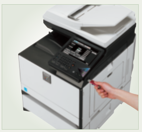
An easily accessible USB connector allows for simplified printing of PDF files from common USB thumb drives.