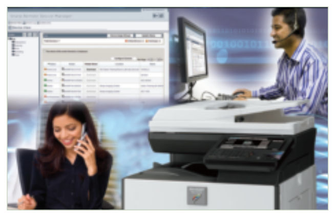
Sharp Remote Device Manager.

SRDM is a device management application, developed by Sharp, which allows the operator to browse and operate an MFP via a web browser . This advanced access allows for easy setup and configuration of the MFP, enabling users to get the most of the advanced features the MX-C301W has to offer!