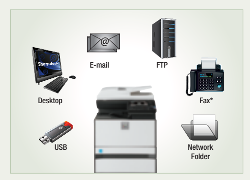
Sharp's integrated network scanning offers one-touch document distribution to multiple destinations.