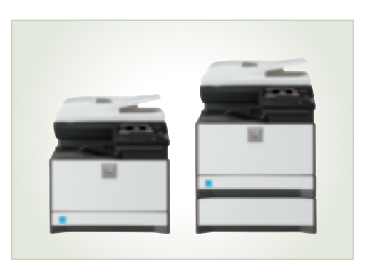
Expandable paper capacity stores up to 800 sheets.