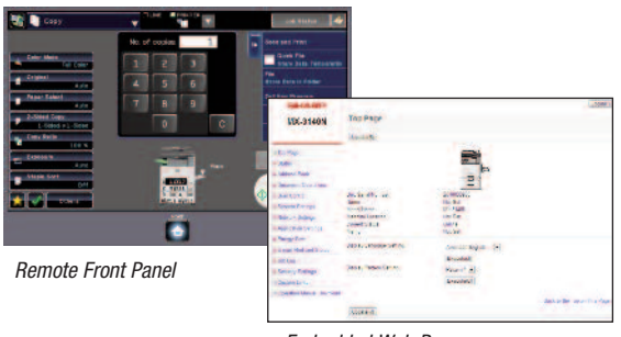
Embedded Web Page

MX-2640N/3140N/3640N and allows you to locate resources and find information specific to your configuration, truly helping you maximize your investment.