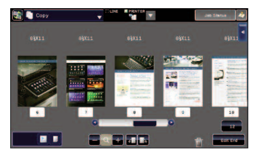
Easily edit documents in scan preview mode.