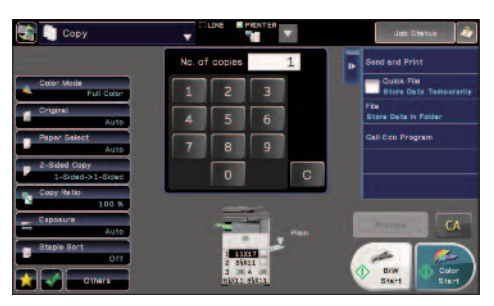
Intuitive copy screen shows options on the left and menu quidance on the right.