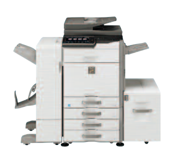
MX-3640N shown with saddle-stitch finisher.

This series offers a choice of two high-performance finishers that can give your documents a professional look and feel. Choose from a compact inner finisher or floor-standing saddle-stitch finisher . Both finishers offer three-position stapling and an available 3-hole punch.