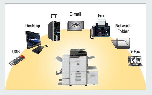
Sharp's integrated network scanning offers one-touch document distribution to up to seven destinations.