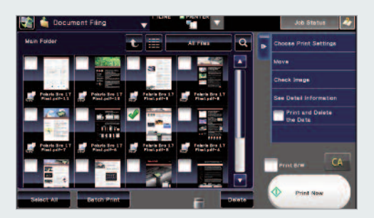
Sharp's Document Filing System with thumbnail preview makes it easy to locate and retrieve stored jobs.