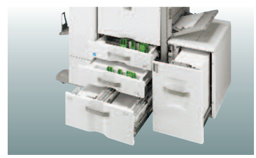
Available paper capacity stores up to 6,600 sheets.