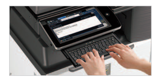
Full-size retractable keyboard simplifies data entry.